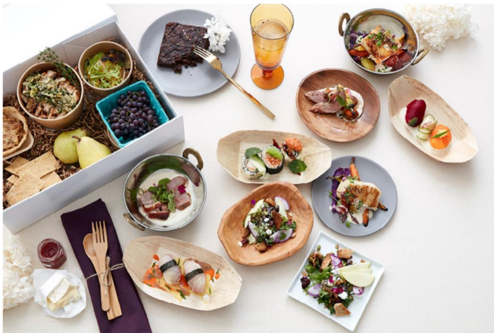
Philadelphia caterers offering packages for micro-weddings include Peachtree Catering & Events (box), Feast Your Eyes Catering (sushi boats) and Brûlée Catering (small plates).

Philly has a stellar lineup of wedding and event caterers who will dish out cuisine with good taste — no matter what your Big Day looks like. That's why some local businesses have pivoted to offer micro-wedding options due to the pandemic , which has caused many couples to change their plans this year — think significantly smaller guest lists, outdoor fetes, and plenty of backyard or at-home soirees. As newly engaged duos plan for near- or far-future celebrations, they're either keeping the current guidelines top of mind or have embraced a new approach, trading big bashes for smaller, more intimate occasions — depending on what matters most to them. While Philly's latest COVID-19 guidelines , put into place November 20th, have impacted gatherings through at least January 1st, that doesn't mean you can't begin your research and planning (and tasting!) now. The list of micro-wedding caterers below will prime your palate for your own Big Day. It's by no means comprehensive; if you have a vendor you think we should know about, please email kschott@phillymag.com . Dig in!