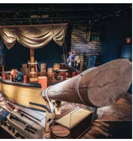
Museum of the American Revolution

National Constitution Center 525 Arch Street - (215) 409-6700 Mon.-Sat. 9:30 a.m.-5 p.m.; Sun. 12-5 p.m.; Extended hours, 9:30 a.m.-5 p.m. 2/16; Ad. $14.50; Sr. (65+)/Col. Stud. (w/ID) $13; Youth (6-18) $11; Child. (under 6) FREE 🛓 🕌