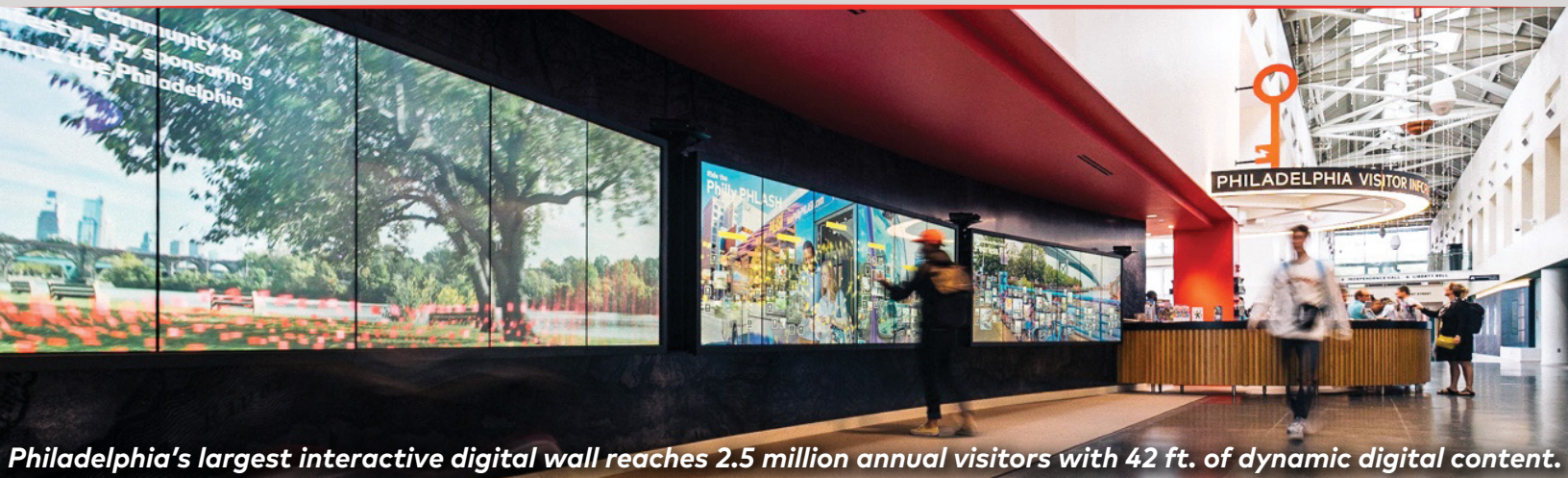
Philadelphia's largest interactive digital wall reaches 2.5 million annual visitors with 42 ft. of dynamic digital content.