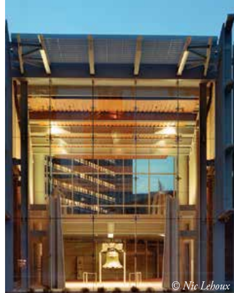
Liberty Bell Center - Courtesy of Layer Architecture