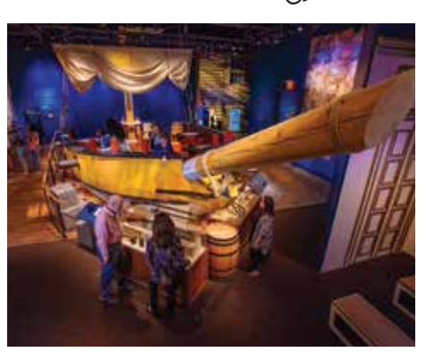
Museum of the American Revolution

D3 National Constitution Center 525 Arch Street - (215) 409-6700 Mon.-Sat. 9:30 a.m.-5 p.m.; Sun. 12-5 p.m.; Ad. $14.50; Sr. (65+)/Col. Stud. (w/ID) $13; Youth (6-18) $11; Child. (under 6) FREE