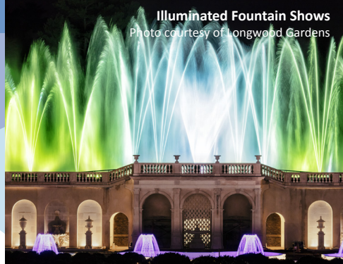
Illuminated Fountain Shows

September 9, 7:30 p.m. | Prices start at $33.00 for reserved seating.