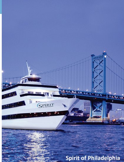
Spirit of Philadelphia