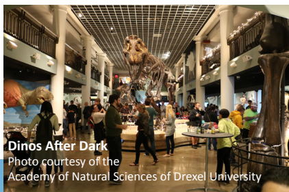
Dinos After Dark

Saturdays, 7:30 and 10:00 p.m. | Adults $18.00, Seniors/Students/Military $15.00 | BYOB