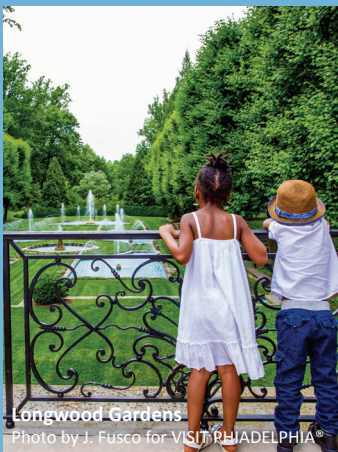
Longwood Gardens