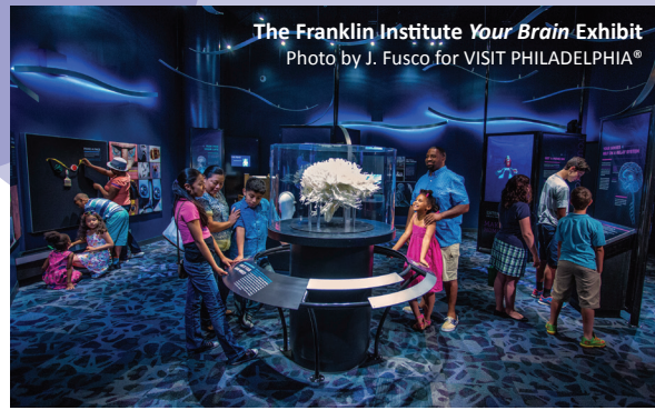
The Franklin Institute Your Brain Exhibit

August 21 and September 18, 5:00 – 8:00 p.m. FREE admission