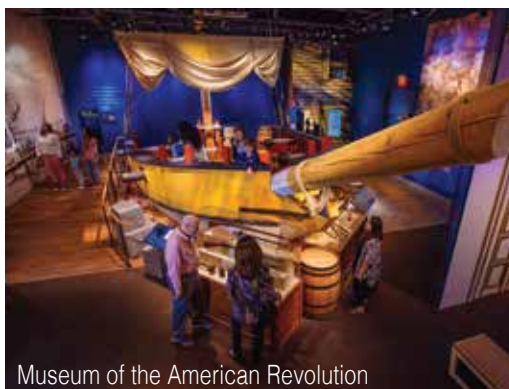
Museum of the American Revolution

Museum of the American Revolution, National Constitution Center