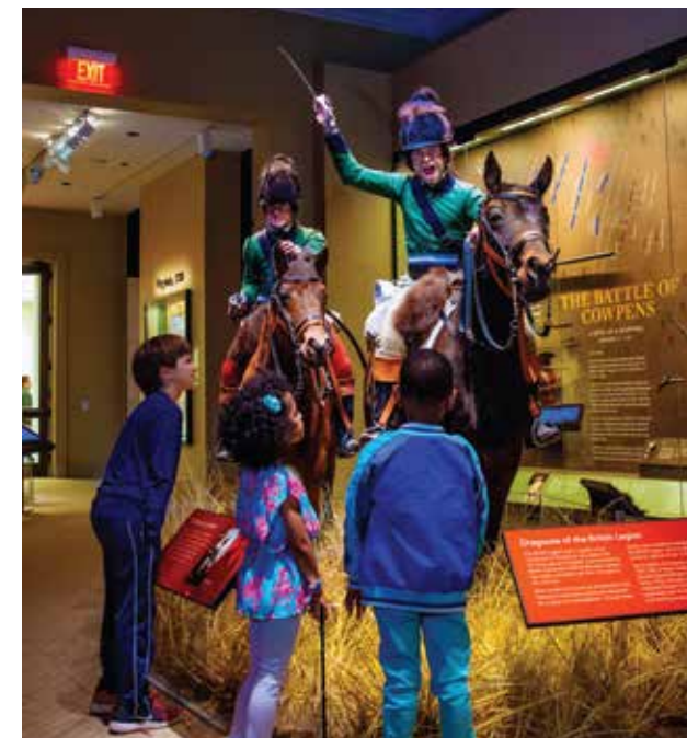
Museum of the American Revolution

Museum of the American Revolution, 10 a.m. & 11 a.m.: Breakfast with General George Washington – Enjoy breakfast with the nation's Founding Father! Tickets include buffet breakfast, admission and interactive activities. Ad. $50; Youth $25; Ch.6 and under $10 (215)253-6731, amrevmuseum.org