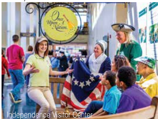
Independence Visitor Center

Once Upon A Nation Storytelling Benches, History Maker Meet & Greets