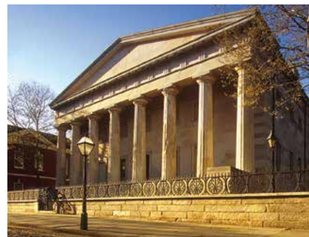
Second Bank of the U.S.

Signers' Garden, 10-11 a.m., Sat. & Sun.: In the Paths of the Founders – Join a park ranger for this orientation tour of Independence National Historical Park. Explore the world-changing events that happened right here, from the Declaration of Independence to the creation of a new government. Free. (800) 537-7676, nps.gov/inde